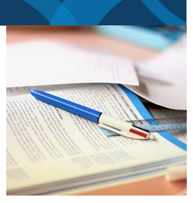
Alternative English Language Test

The proposed visa scheme would allow companies to fast forward the 457 skilled worker visa by bringing candidates to Australia for up to one year without the effort of submitting an application for 457 employer sponsored visas.