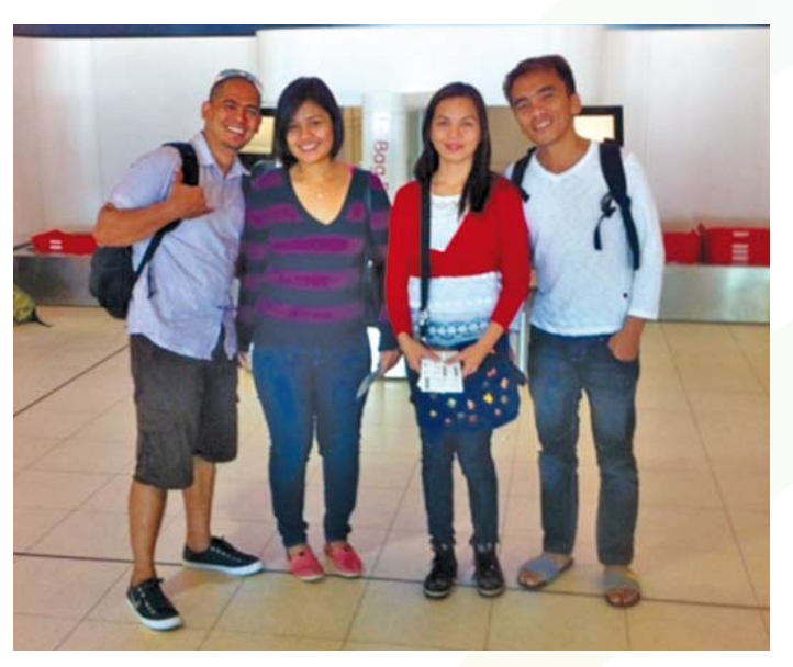
Four new recruits have arrived for McDonald's in Port Hedland.

If your regional WA business is finding it hard to recruit local staff, or you know someone in that situation, get in touch with us today.